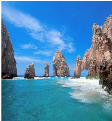
Cabo San Lucas