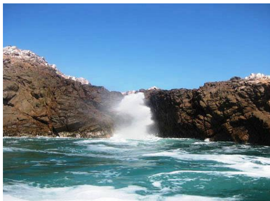
Blowhole - Ensenada

Ngày 4 - Day 4 – Monday : Los Angeles (Long Beach), California ( Arrive 8:00 am )